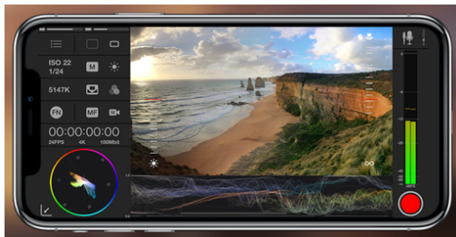
Mavis Pro camera

With the lower price point comes the con of a more challenging interface on Mavis Pro compared to the Filmic Pro app. There are other options available, but these two apps come highly rated. It's always recommended to check for yourself and see which one works best for you.