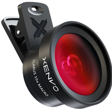
XENVO PRO kit

Others like Fisheye, sparkle, or even anamorphic seem unnecessary for beginners.